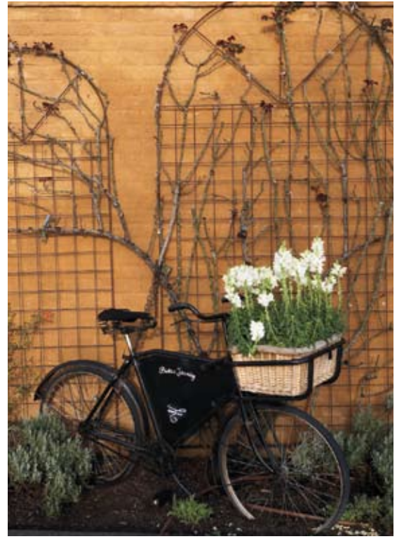
Clockwise from left: Ma(i)sonry; dish hutch, check-in, official wheels, and smoked trout at Bistro Jeanty; Ma(i)sonry centerpiece. Following pages, left to right: Bouchon's French decor, plating, and raw bar; Bouchon Bakery.